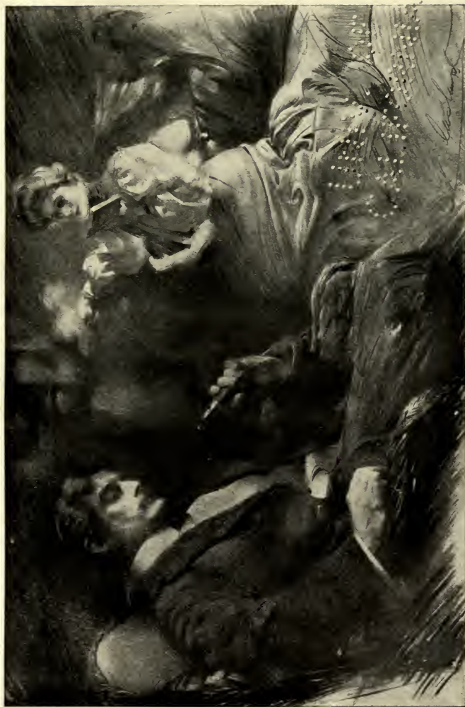
“Turning, looked straight at Selwyn.”